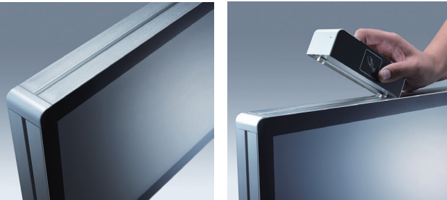
Side groove design for Flexible peripheral device